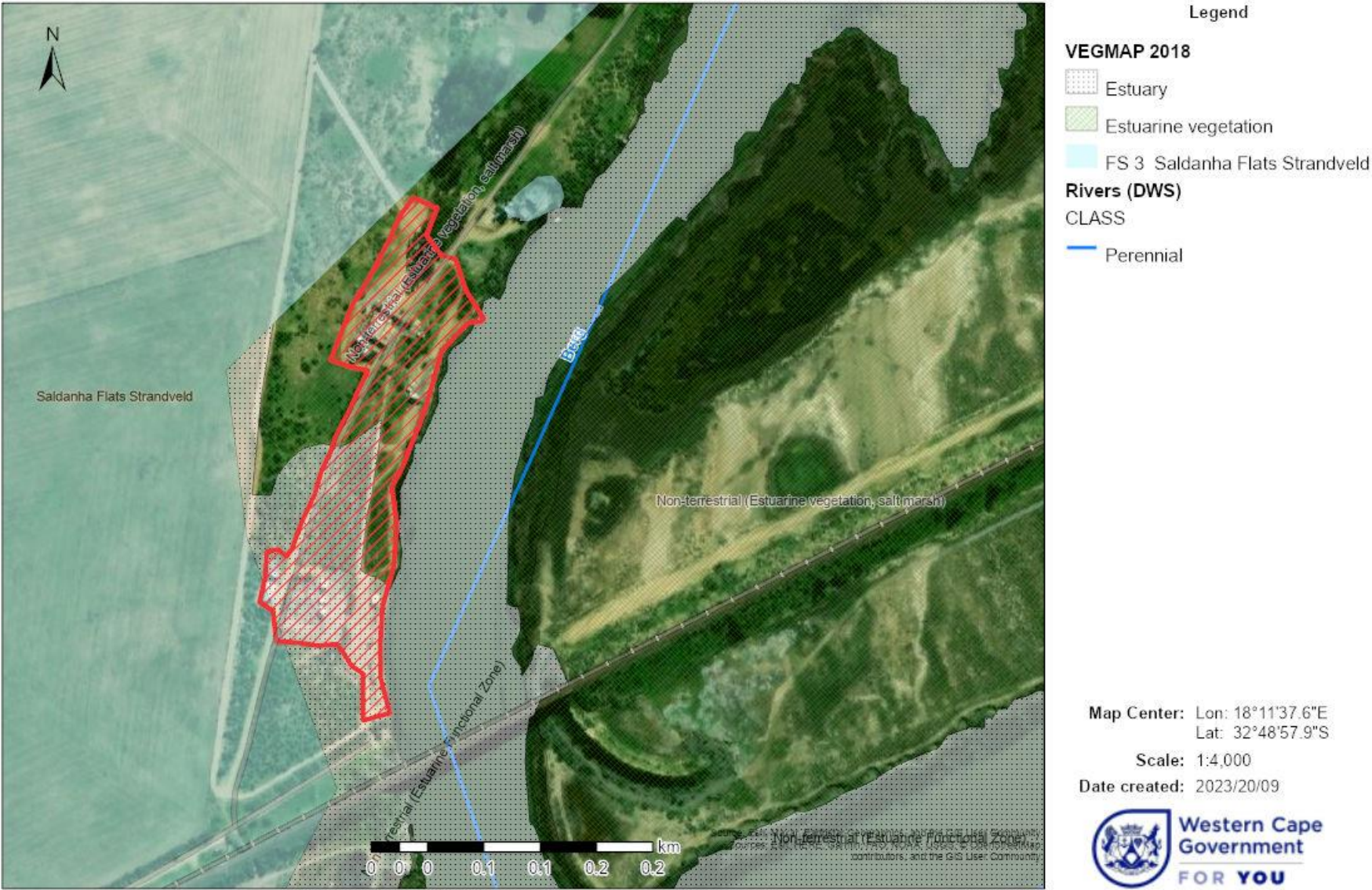
Map 6: Vegetation Map 2018 of of Knor Varkie camp site and associated facilities on Farm Kliphoek 8/59.