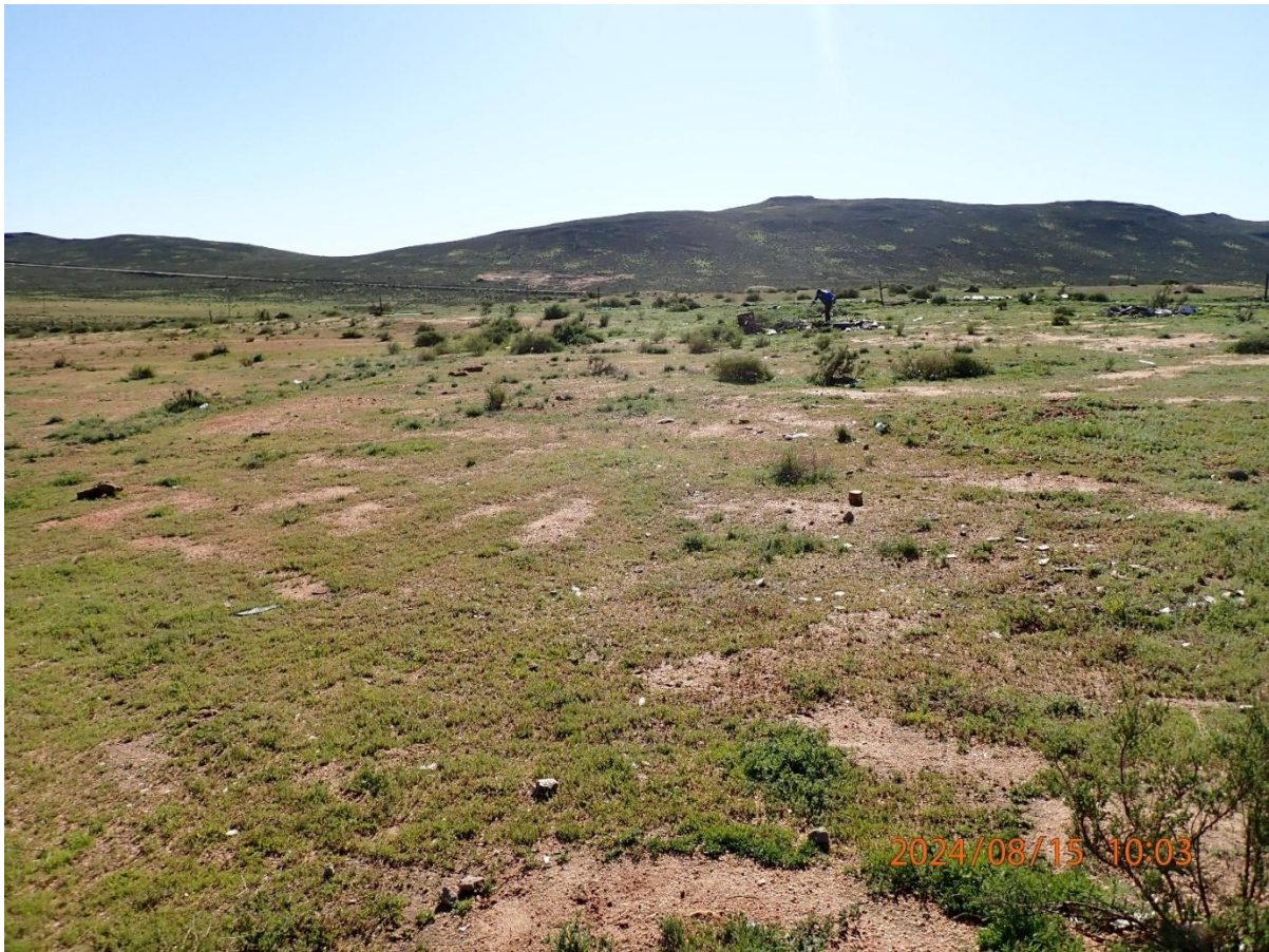
Photograph 1: Status and habitat condition on erf 182.