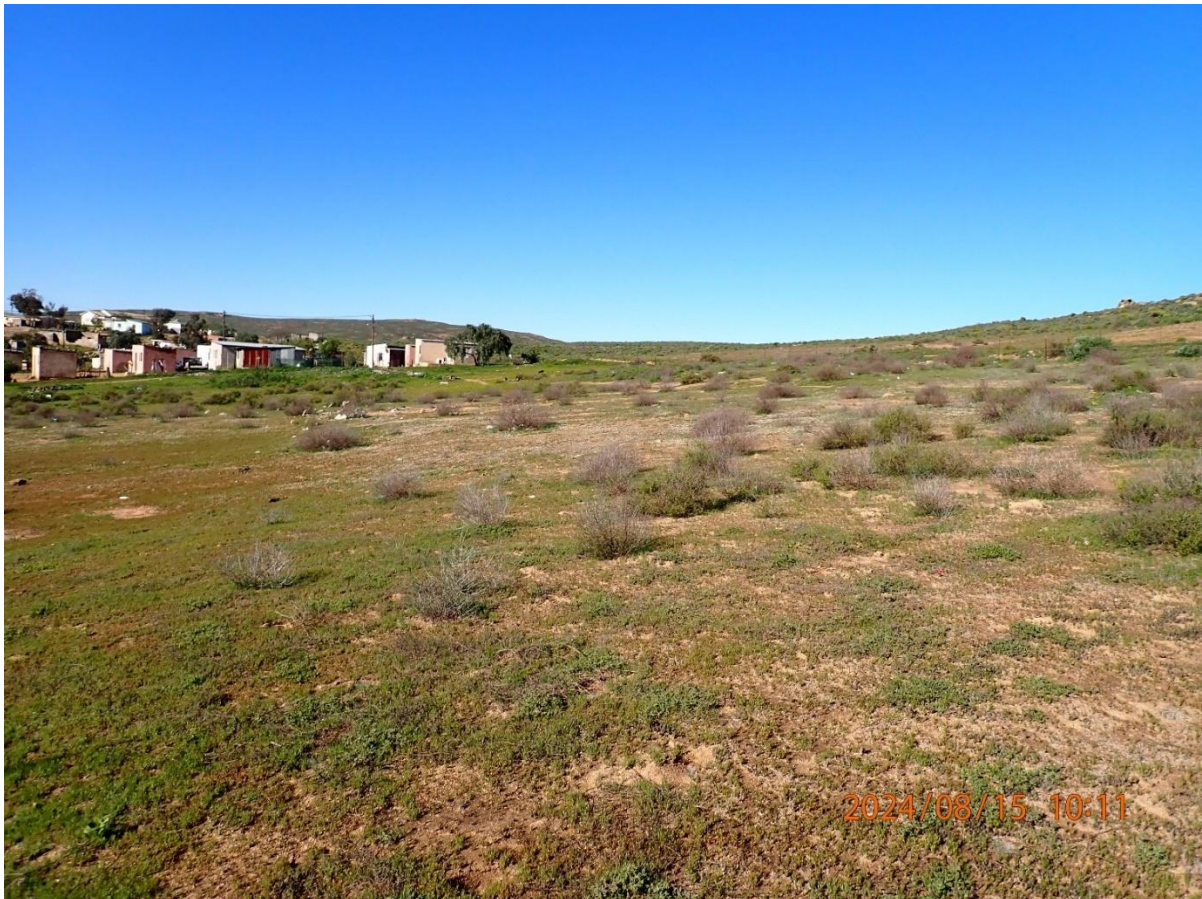
Photograph 3: Status and habitat condition on erf 184.