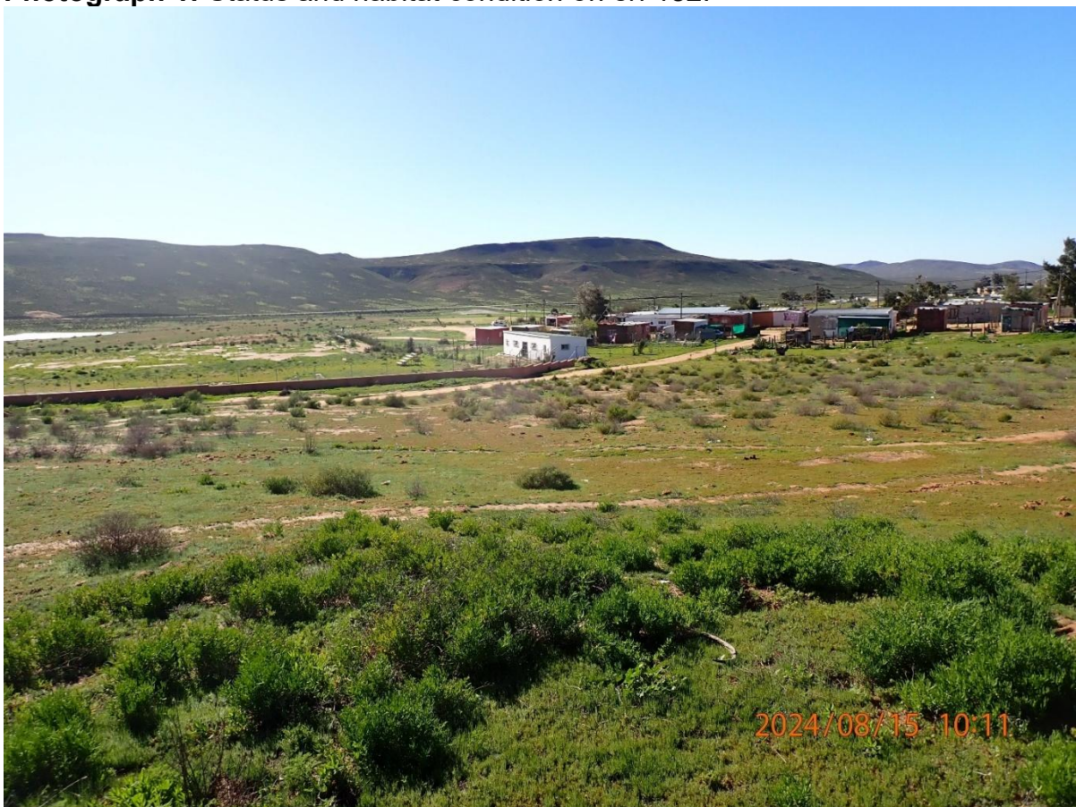
Photograph 2: Status and habitat condition on erf 184.