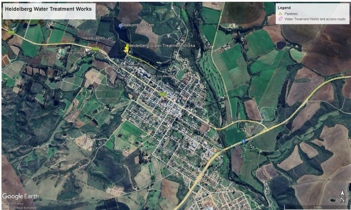
Map 2: Location of proposed Heidelberg Water Treatment Works (in yellow) northwest of the town Heidelberg, Western Cape.