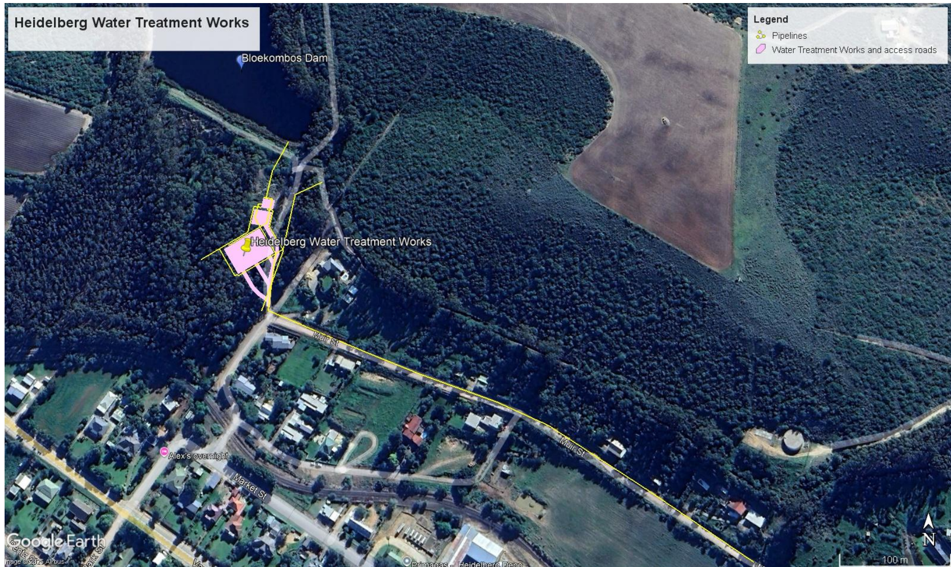
Map 3: Location of proposed Heidelberg Water Treatment Works just below (immediately south of) the Bloekombos Dam, WesternCape. 34° 4'57.11"S 20°56'57.24"E