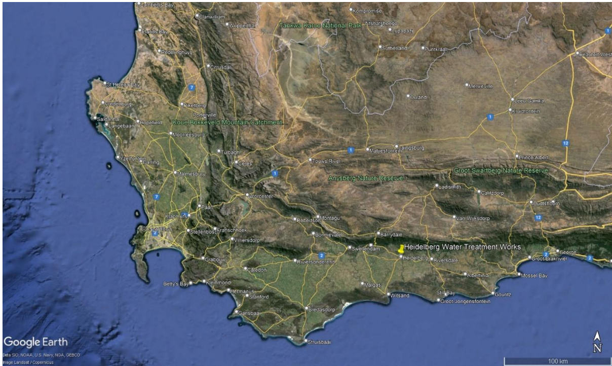
Map 1: Location of Heidelberg in the Western Cape.