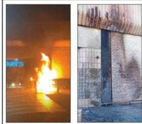
Links: 'n Skermgreep vanaf 'n Facebook-plasing op die groep Oudtshoorniete Staan Saam. Regs: Die skade was ooglopend, maar beperk.

Die polisie het 'n paar minute daarna opgedaag en die man veilig by sy huis gaan aflaai", het sy aan Die Hoorn vertel. Sy het verder gesê dat dit vir haar hartverskeurend is dat mense se lewens so in gevaar kan wees, en dit oor R70 wat die man op 'n eerlike en hardwerkende manier verdien het.